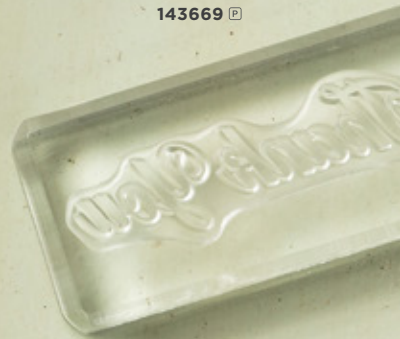
Daisy Delight Stamp Set 143669