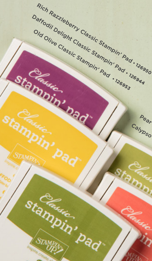
Rich Razzleberry Classic Stampin' Pad • 126950 Daffodil Delight Classic Stampin' Pad • 126944 Old Olive Classic Stampin' Pad • 126953