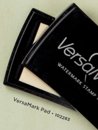
VersaMark Pad • 102283