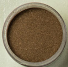
Gold Stampin' Emboss Powder 109129