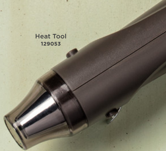
Heat Tool 129053